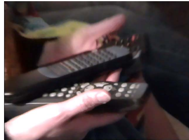
Figure 1. The field research explored current home entertainment behaviors.

one DINK or Dual-Income No Kids) and we met with all household members at once.