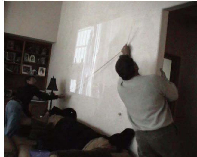
Figure 4. Respondents imagined the impact of the Zoetrope on their environment and on their behavior.

People implicitly divide their homes (not to mention their entire selves) into front stage and back stage [1]. Front stage is the more public area (i.e., kitchen, living room, front yard) where families display their aspirations to the rest of the world, while back stage is the private areas (i.e., bedrooms, office, computer room) where people will act as their private selves. There were substantial objections to the notion of having a big screen TV in the living room, as one respondent proclaimed “our lives are about interacting with people, not about focusing on the television.”