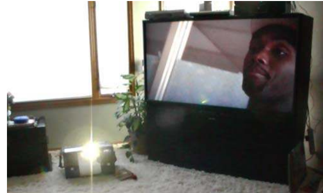
Figure 3. The Zoetrope prototype (left).

attempt to provide a brand, aesthetic, or user interface experience in the form itself. Because this was a home theater device, there was much to be experienced outside the form of the artifact itself – in other words, watching and listening to the movie that the Zoetrope enabled.