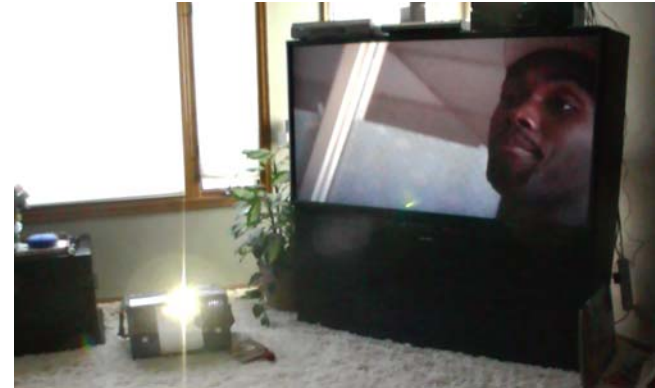
Figure 3. The Zoetrope prototype (left).

attempt to provide a brand, aesthetic, or user interface experience in the form itself. Because this was a home theater device, there was much to be experienced outside the form of the artifact itself – in other words, watching and listening to the movie that the Zoetrope enabled.