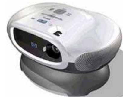
Figure 6. Hewlett-Packard ep9010 Instant Cinema Projector

Shortly after completion of this research, HP decided not to pursue further development of Zoetrope. After a number of months that decision was reviewed and the product group resumed their work. In addition, we revisited the research to understand implications for the projection TV category. In November 2004, HP began shipping the ep9010 Instant Cinema Projector.