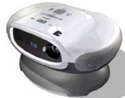
Figure 6. Hewlett-Packard ep9010 Instant Cinema Projector

Shortly after completion of this research, HP decided not to pursue further development of Zoetrope. After a number of months that decision was reviewed and the product group resumed their work. In addition, we revisited the research to understand implications for the projection TV category. In November 2004, HP began shipping the ep9010 Instant Cinema Projector.