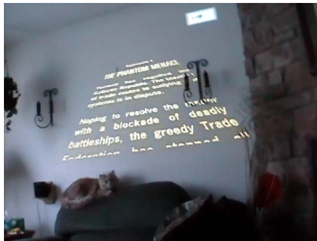
Figure 2. Deming the Zoetrope home theater experience

The prototype itself was a “breadboard” – in other words, a works-like device that proved the concept in terms of technology. It was assembled by engineers using whatever components were available, with no